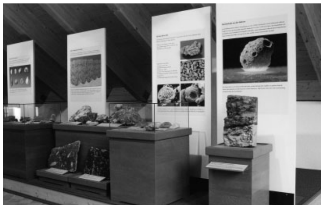
Figure 4 The Geozentrum Gams. Section of the formation of jet and jet mining.

loch Gorge, which originates at a large karstic spring, provides deep insight into the geological activities of water. This most powerful of all geological agents may be explored in the Water Park of St. Gallen and at GeoRafting, which combines science with adventure. The GeoWorkshop serves all activities related to the preparation of geological items. Recognition as a member of the European Geoparks Network in 2002 has provided new impulses for the park.