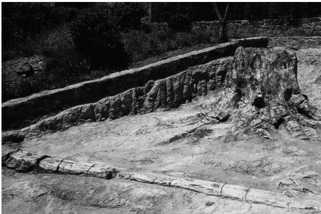
Figure 8 Standing petrified trunk of a precursory form of pine whose root system has been uncovered in the Petrified Forest Park of Lesvos. Next to it, a slim-trunked conifer which could not withstand the violent volcanic explosion was broken off from its root system and carried off by the pyroclastic materials whose onrush flooded and covered the forest.

The Museum, covering an area of 1597 m 2 includes permanent and temporary exhibition halls, an audio-visual room, library, laboratory, snack bar and museum shop. The permanent exhibitions include "the Petrified Forest Hall", which presents the evolution of plant life on earth from the appearance of the planet's first single cell organisms to the developed plant life and the creation of the petrified forest. The flora of the petrified forest is presented with fossil remains of over 40 different species found and identified in the broader area of western Lesvos. "The Evolution of the Aegean Hall", presents the various geological phenomena and processes associated