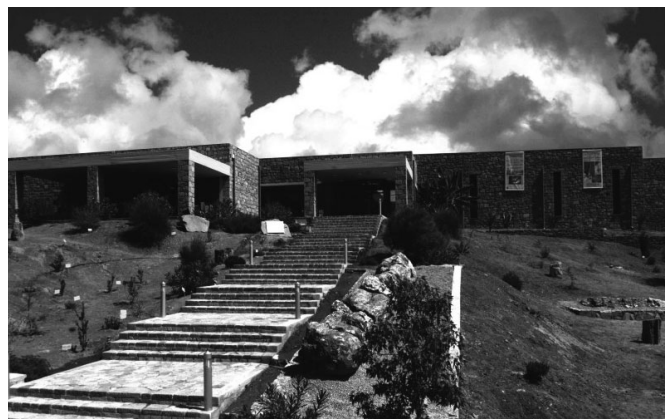
Figure 10 The Natural History Museum of the Lesvos Petrified Forest in Sigri.

The Museum also organises special thematic events to celebrate special days (i.e. Museums International Day, Day of Monuments, Day of the Earth, Day of the Environment, European Heritage Days, music events on the August full moon night). It also participates in the pan-hellenic promotional campaign of these events which is