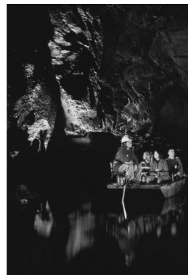
Figure 3 Underground boat trip in the Marble Arch Caves.

Over the years Marble Arch Caves have attracted international recognition for their management approach that successfully combines conservation, development, and education with tourism. These efforts were rewarded in 2001 when Marble Arch Caves and the Cuilcagh Mountain Park became the first European Geopark in the United Kingdom.