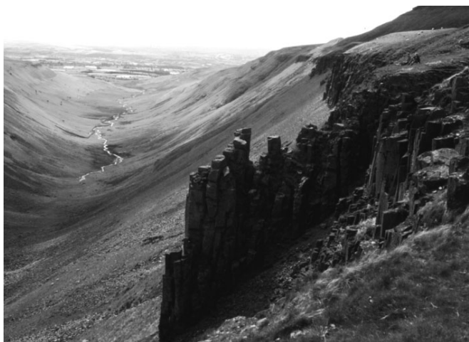
Figure 5 The Great Whin Sill at High Cup Nick above Dufton on the Pennine Way.

This is a high, wild landscape of open moorland, tumbling rivers and green dales, stretching across 2000 square kilometres of County Durham, Cumbria and Northumberland. It is the second largest of the 41 AONBs in England and Wales, landscapes recognised by Government as the equal of the National Parks. It is noted for its diversity of wildlife and for its nationally recognised scenic qualities, but it also has a world-class geological heritage. This geological interest, coupled with past and planned effort for its conservation, led to the Geopark designation being conferred on the area. In the year since designation, the North Pennines AONB Partnership Staff Unit, which manages the Geopark designation locally, has been working closely with the British Geological Survey to produce the first Geodiversity Action Plan (GAP) for a UK protected landscape. As well as being