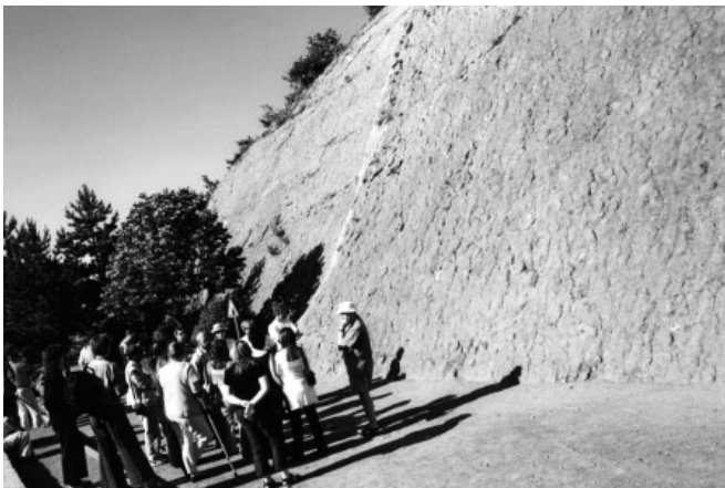
Figure 2 The limestone wall with an enormous amount of ammonites, near Digne.