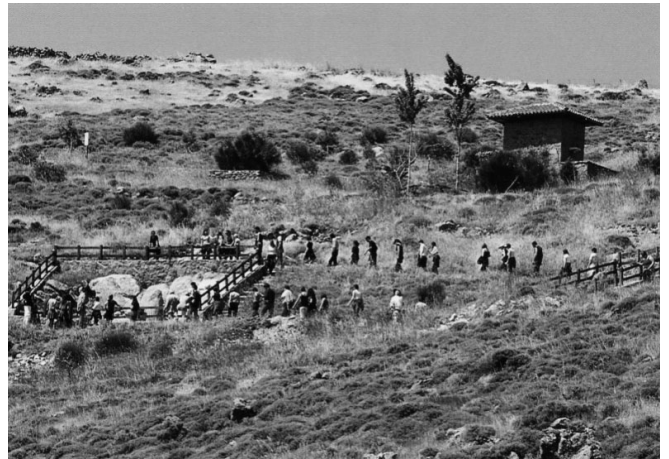
Figure 9 University students visit a fossil site in the Petrified Forest Park.

with the creation of the Petrified Forest and the general geological history of the Aegean basin over the last 20 million years.