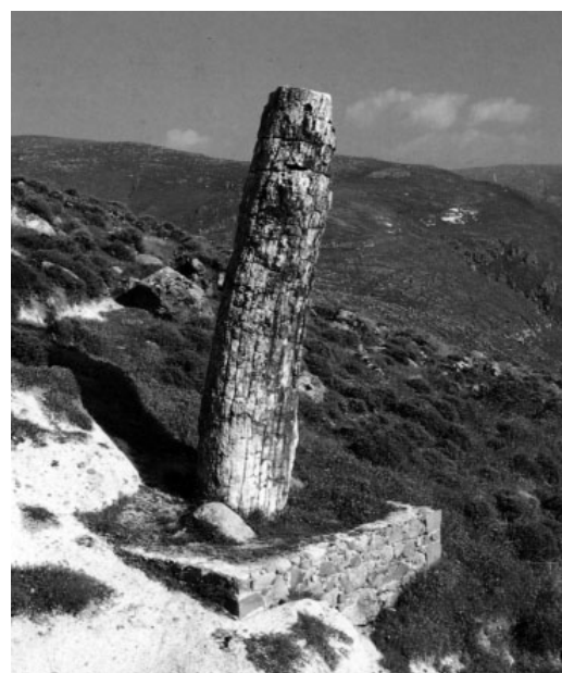
Figure 6 The most typical standing petrified trunk of a conifer in the Petrified Forest Park belongs to the species of Taxodioxyylon gypsaceum .

Covering an area of 30 hectares, the Petrified Forest Park constitutes a unique natural monument. The numerous perfectly pre-