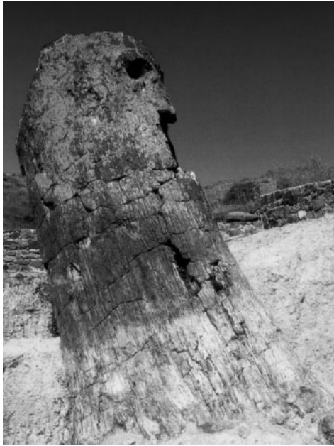
Figure 7 A huge standing trunk of a petrified tree that can be found in the Petrified Forest Park. It belongs to the species of Taxodioxyton gypsaceum . Its height is 7.02 m and its circumference 8.58 m.

served standing trunks that constitute a complete petrified ecosystem immediately impress the visitor. Small-scale interventions were made in order to effectively conserve the fossil sites and to facilitate visitor access. These include protective low stonewalls and wooden fences that have been designed and built to guard the petrified trunks from run-off water and erosion, stone shelters with water fountains that have been built along the trails, and cobblestone pathways, stone bridges and stairs that were carefully added to the trail system.