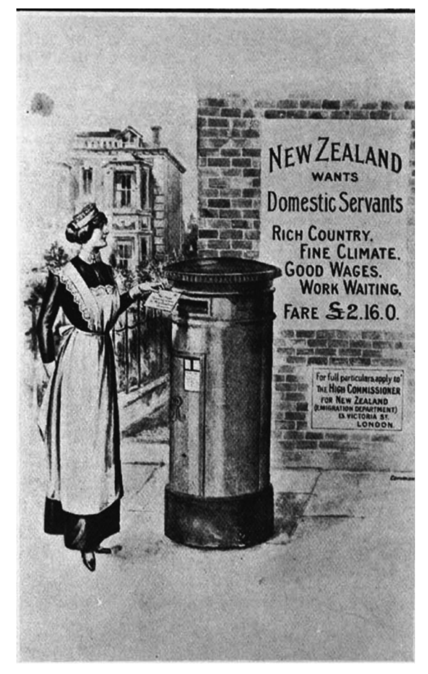
Figure 6.1 New Zealand wants domestic servants (circa. 1913)