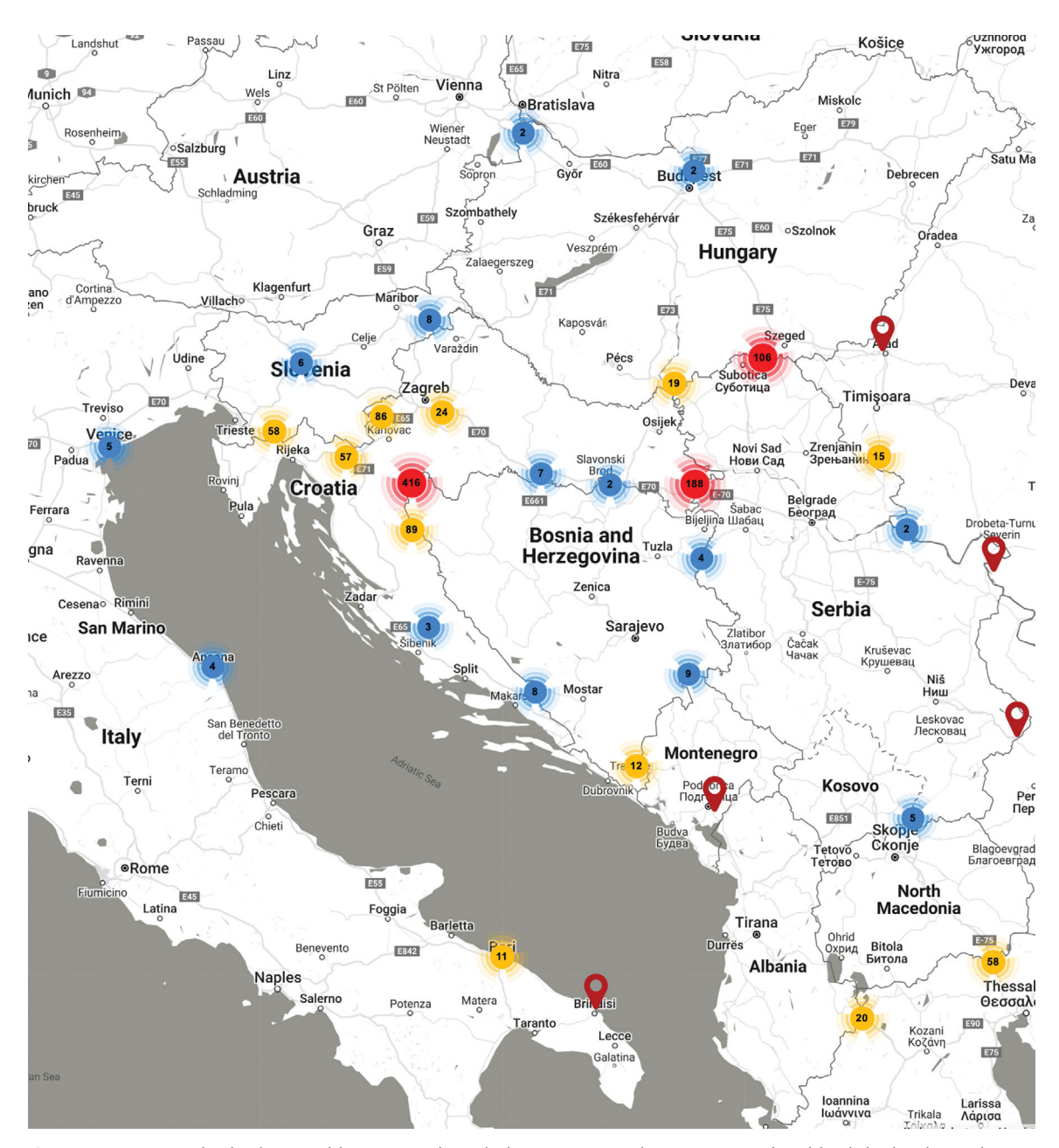
Figure 3. Open-source map of refusal created by BVMN (2020) showing geographic instances of pushback by border authorities.

by focusing on the "major push-back zones" themselves (see Figure 4).