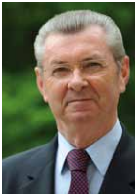
Henri de RAINCOURT, Minister, attached to the Ministre d'État , Minister of Foreign and European Affairs, responsible for Cooperation