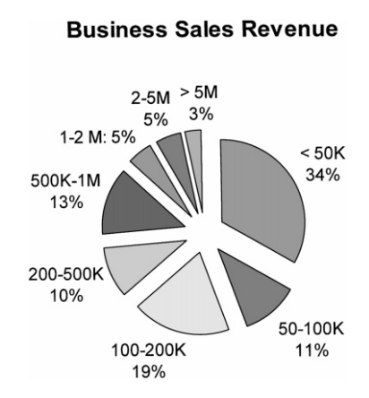
Fig. 3. Profile of Respondents by Business Sales.

size to an even 100. The businesses in the final sample were indeed small, with the median number of employees being four. They represent a broad cross-section in terms of type and location. As shown in Fig. 2, 39 percent of the businesses are in the service industry. The next largest groups are in manufacturing and retail. Of these, 70 percent are located in urban areas, and 30 percent in rural areas. The annual sales range from less than $50 000 to over five million; the median is in the $100 000–$200 000 range (Fig. 3).