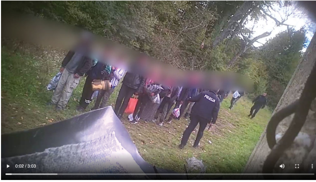
Figure 1. 7 October 2018: A still from hidden-camera footage obtained by BVMN showing a pushback in progress at the Bosnian border by men in Croatian police uniform (coordinates 44.7316124, 15.9133454). The policeman in the foreground has his gun drawn. Seconds later, the policeman in the background kicks a detainee.

Croatian state's response to this footage was, in the words of BVMN (2020), one of "point blank denial."