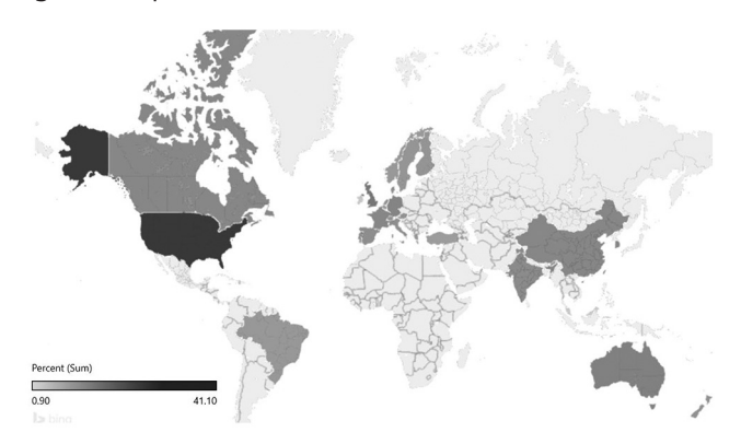
Figure 3 Map of authors

Their work studies in an integrated way relationship benefits and mediators to model the consumer–green brand relationship and provides a better understanding of the antecedents of consumer loyalty towards green brands.