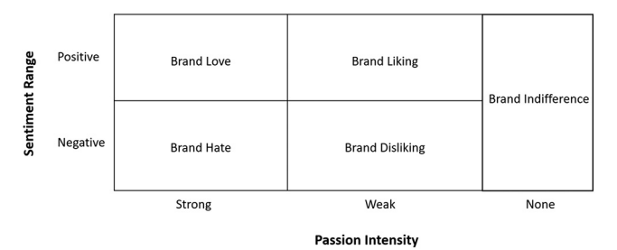
Figure 1 Consumer–brand relationship on the individual level on the basis of the passion intensity and sentiment range