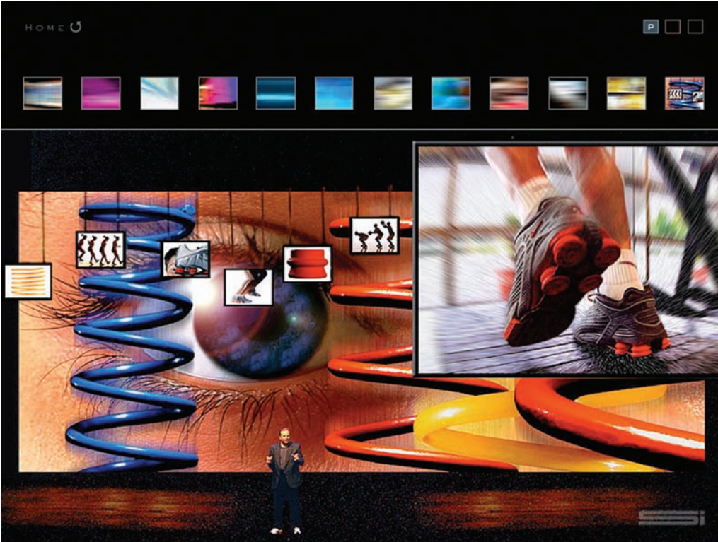
Figure 3: Sound Images promotional media display.