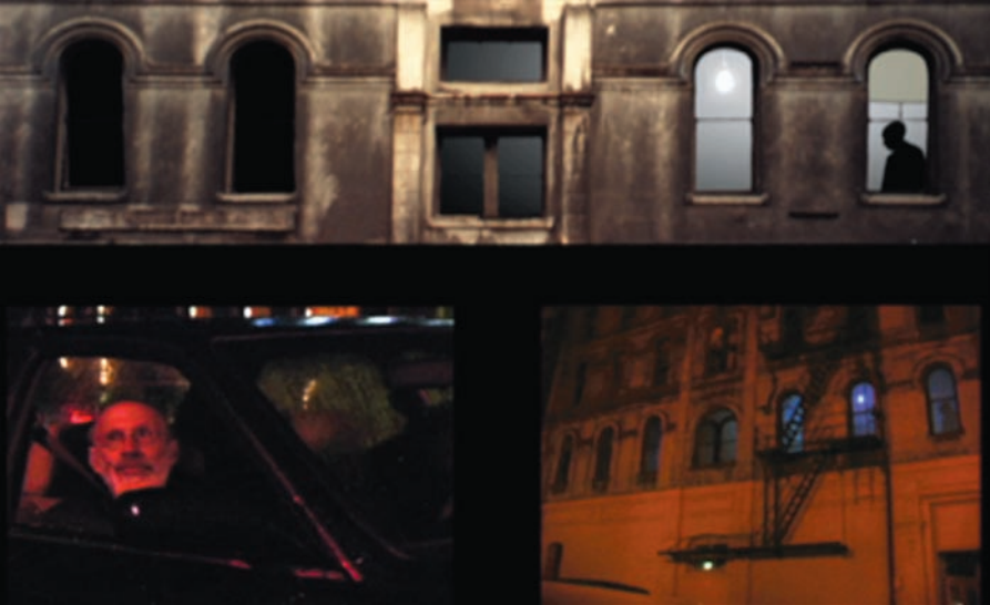
Figure 7: Detail of Mr Wu from Rose Bond's Illumination No. 1.