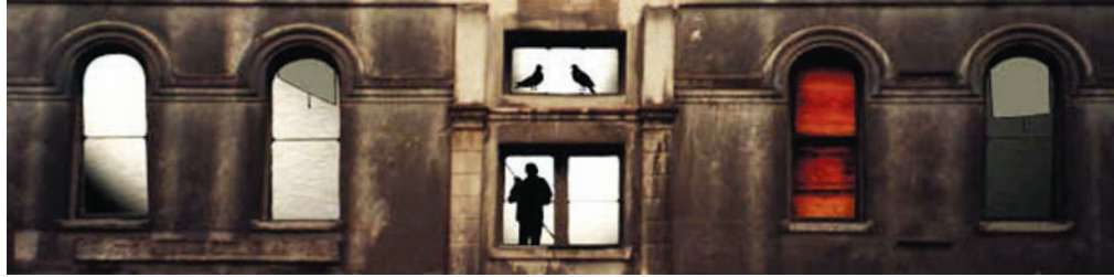
Figure 5: Rose Bond's Illumination No. 1 in the Portland Seamen's Bethel Building, Portland.