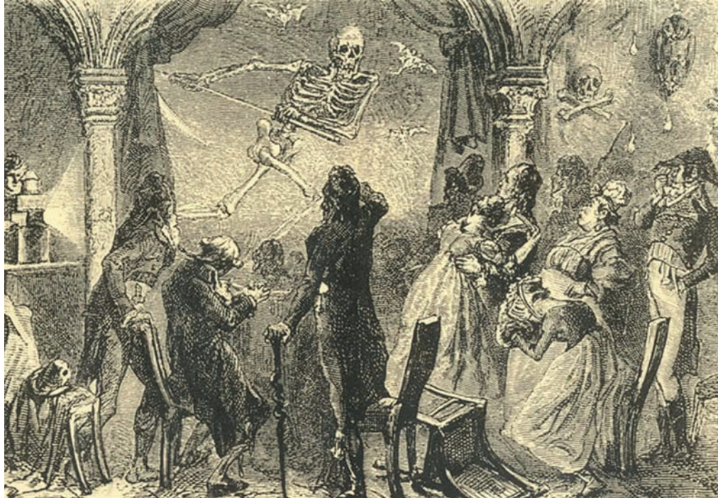
Figure 4: Etienne-Gaspard Robertson's rear projection from Phantasmagoria.