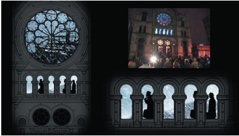
Figure 1: Rose Bond's Intra Muros in the Utrecht City Hall, Holland.