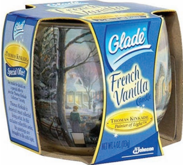
Figure 6: Thomas Kinkadee cottage.