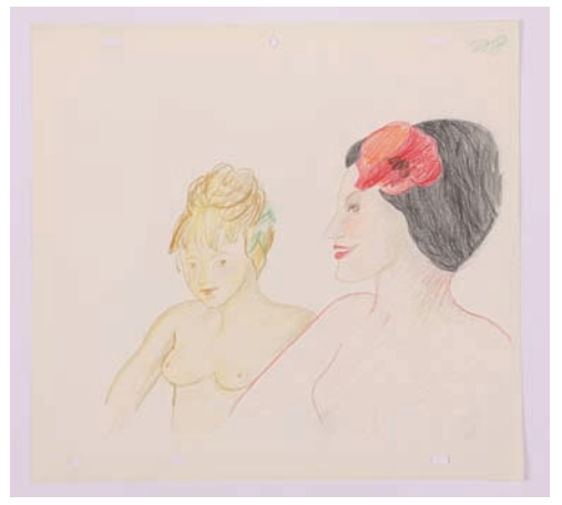
Figure 8: La donna è mobile (Monique Renault, 1993).