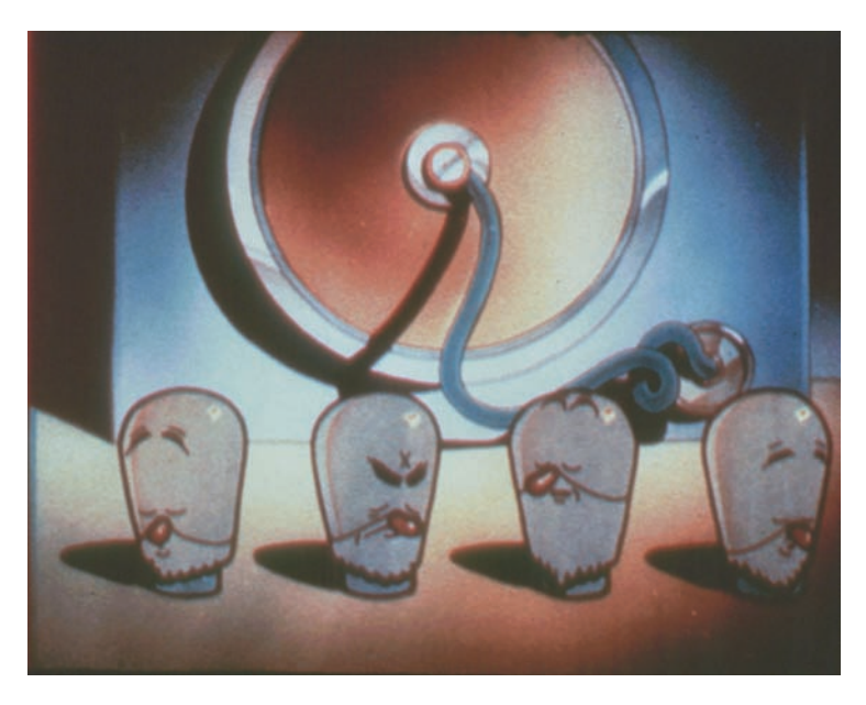
Figure 5: Two pieces of film stock of a George Pal film: one before and one after preservation.