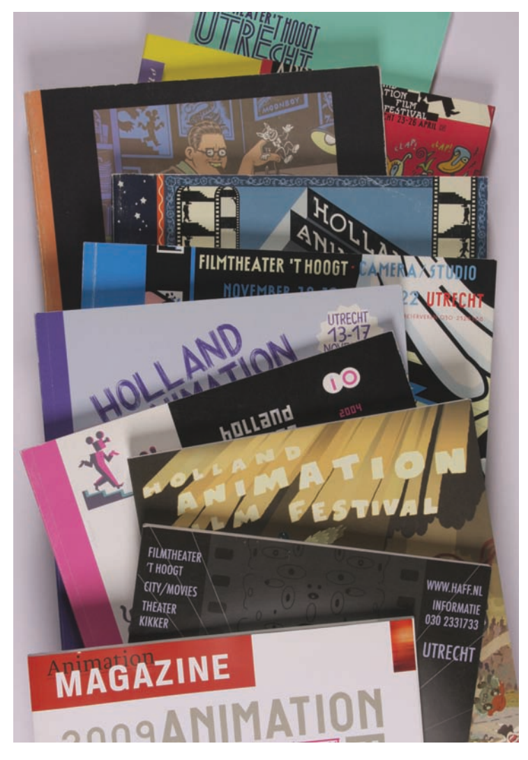
Figure 7: HAFF catalogues.