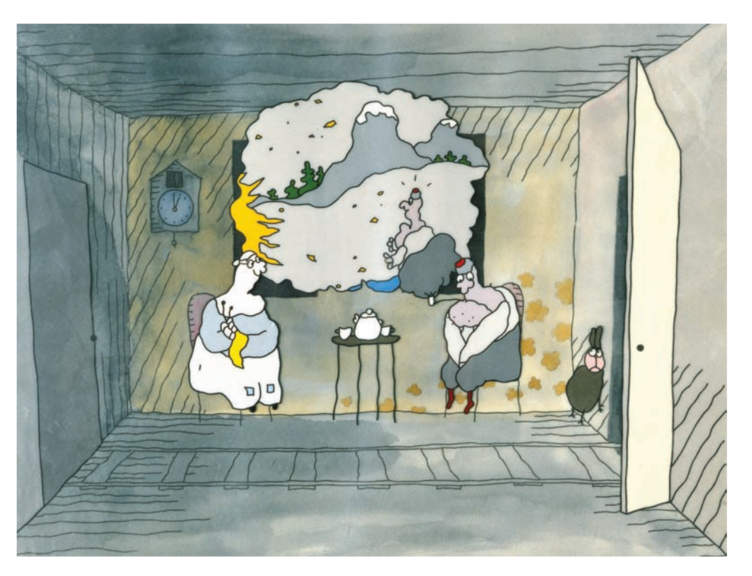
Figure 6: Home on the Rails (Paul Driessen, 1981).