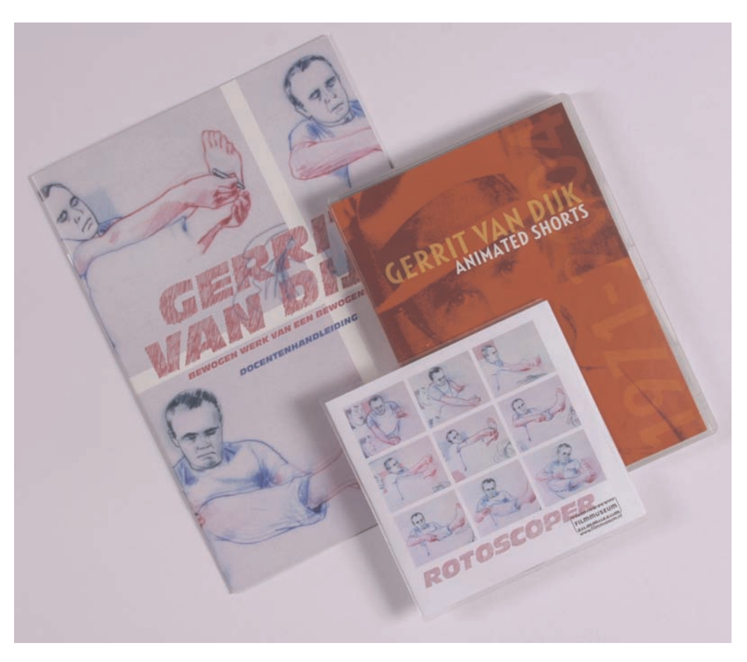
Figure 3: Gerrit van Dijk teaching materials: booklet, CD-ROM and DVD.